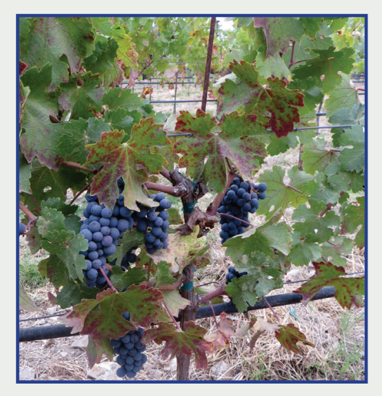
Red blotch in Cabernet franc.