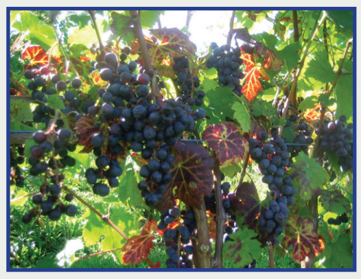
Leafroll in Cabernet franc.