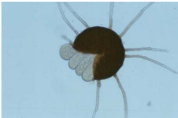
Figure 2. Cleistothecium squashed open to show several asci with ascospores.