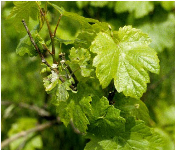
Jay W. Pscheidt

When green shoots and canes are infected, the affected tissues appear dark brown to black in feathery patches (Figure 7). Patches later appear reddish-brown to black on the surface of dormant canes. You can scout for powdery mildew while dormant pruning by looking for these symptoms (Figure 8). It will indicate where in the vineyard you need to concentrate scouting and control efforts in the coming year.