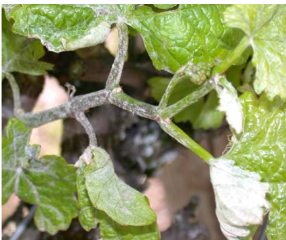
Walt Mahaffee, USDA-ARS