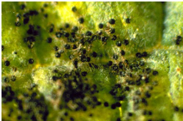
Figure 1. Cleistothecia of grape powdery mildew on the surface of a leaf.