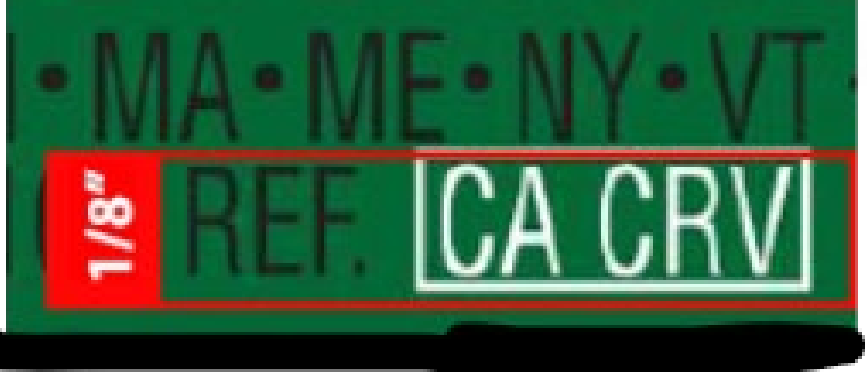
Font size must be 1/8" not Text Box